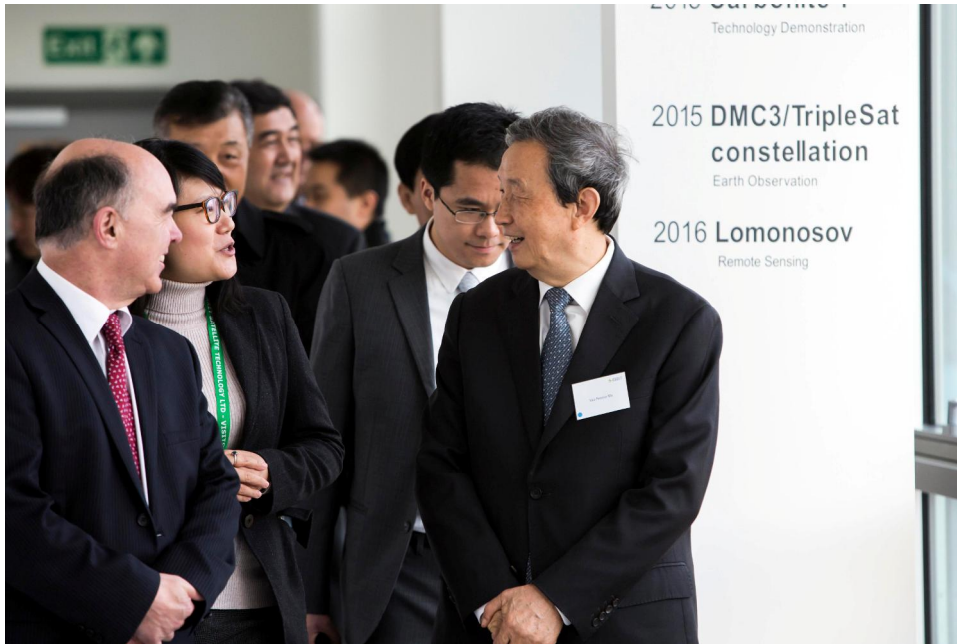
Sir Martin Sweeting and Vice Premier Ma Kai on a tour of SSTL's facilities in Guildford, UK