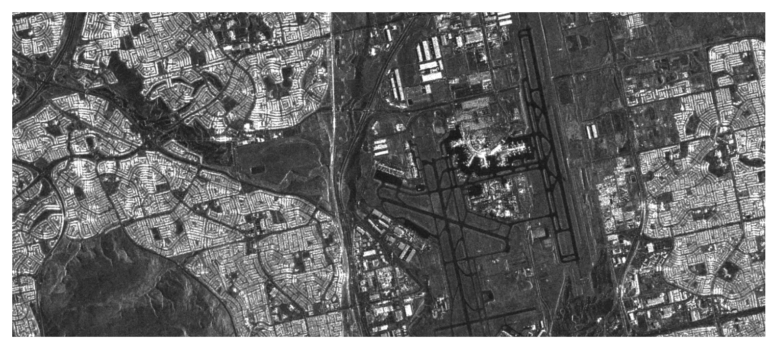
Calgary, Canada – 6m HH Pol Stripmap Mode