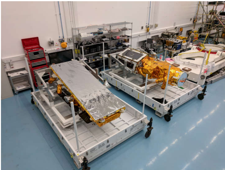
NovaSAR-1 and SSTL S1-4 in flight cases at SSTL, UK before shipment to launch site, August 2018