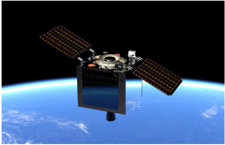
TrueColour satellite

Full size accompanying images for this press release can be downloaded at https://www.sstl.co.uk/MULA