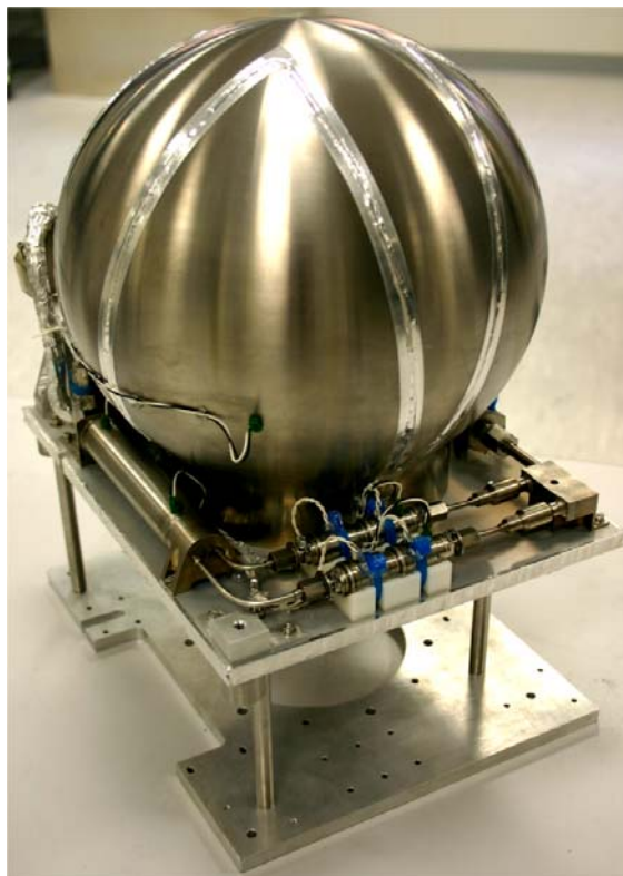
Xenon Hot Gas propulsion system