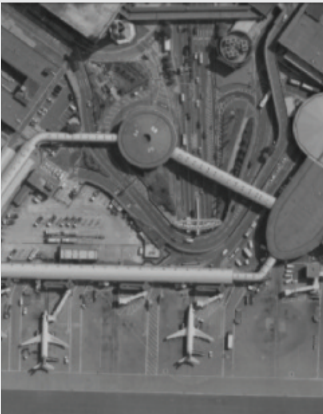
Example SSSL 300 S1 high resolution imagery

The SSSL 300 S1 is a new world-leader in its class of Earth Observation satellites. Continuous technology innovation means that sub-metre imagery is possible, along with quality and quantity of images to meet demanding rapid response applications.